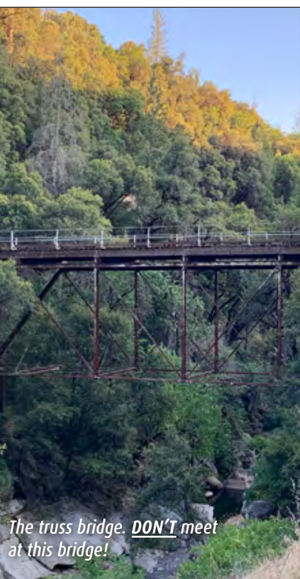
The truss bridge. DON'T meet at this bridge!

We will meet by the small concrete bridge (see picture below) that crosses over the North Fork of the Cosumnes River. Click here for a Google map.