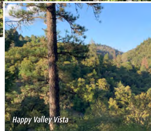
Happy Valley Vista

Happy Valley is 22 minutes from Main Street in Placerville. Initially we will meet at the small concrete bridge not at the truss bridge (See picture and directions below).